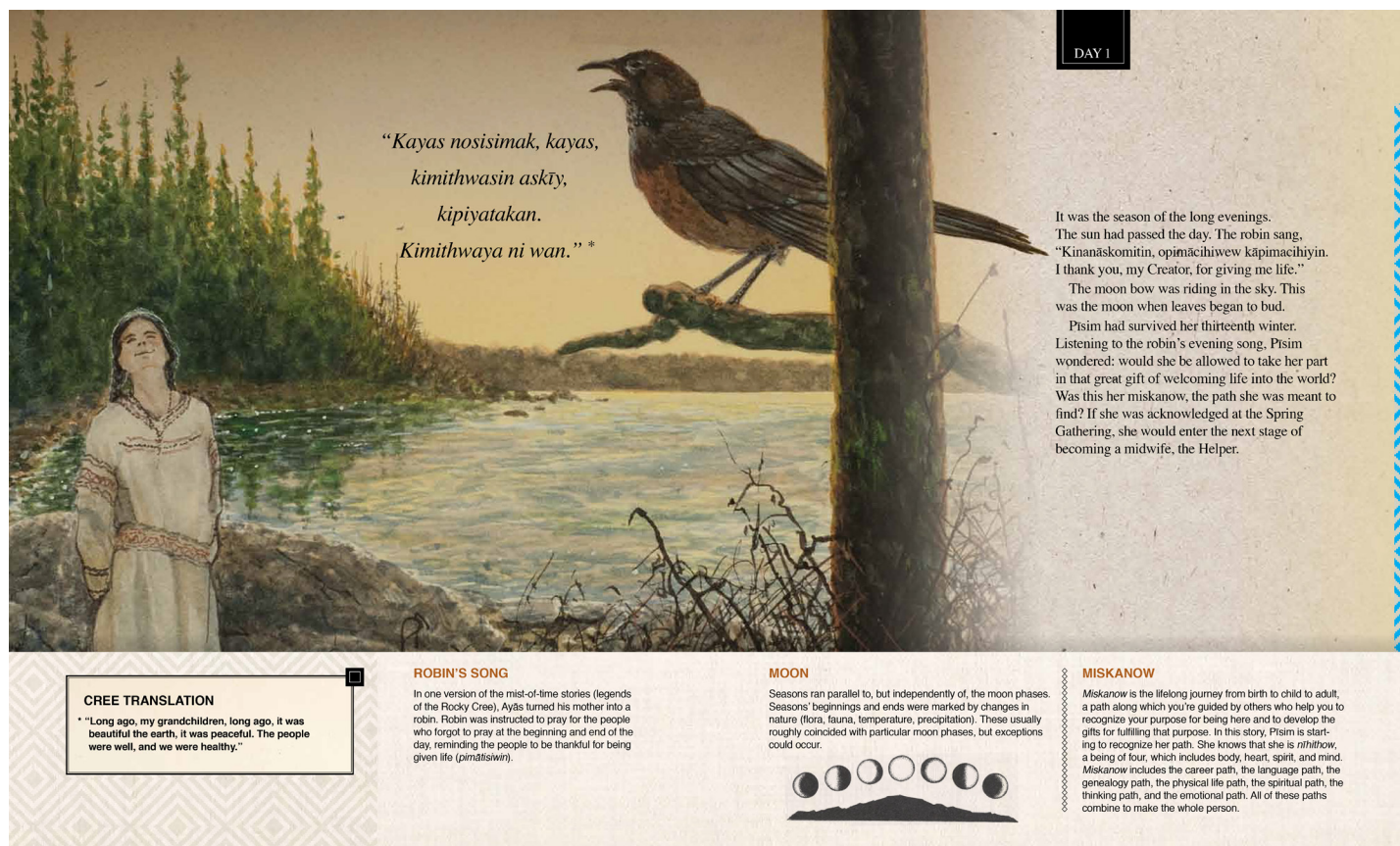
Images from Pisim Finds Her Miskanow (HighWater Press, 2013) and the beta app.